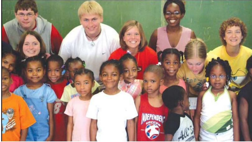
Students from Circle-Rock Prep School in Chicago and CSM participants gather together one last time after enjoying the day together.

For many teenagers (and adults) who grow up in middle- and upper-class America, grasping the concept that poverty exists in our backyard is sometimes difficult. We glimpse what's happening in our cities on the news every night. But words like homeless, gangs, hunger, or murder are mostly just attached to statistics. To picture a face and know the individual stories behind the statistics is impossible— unless we are willing to open our eyes to what's happening right next door.