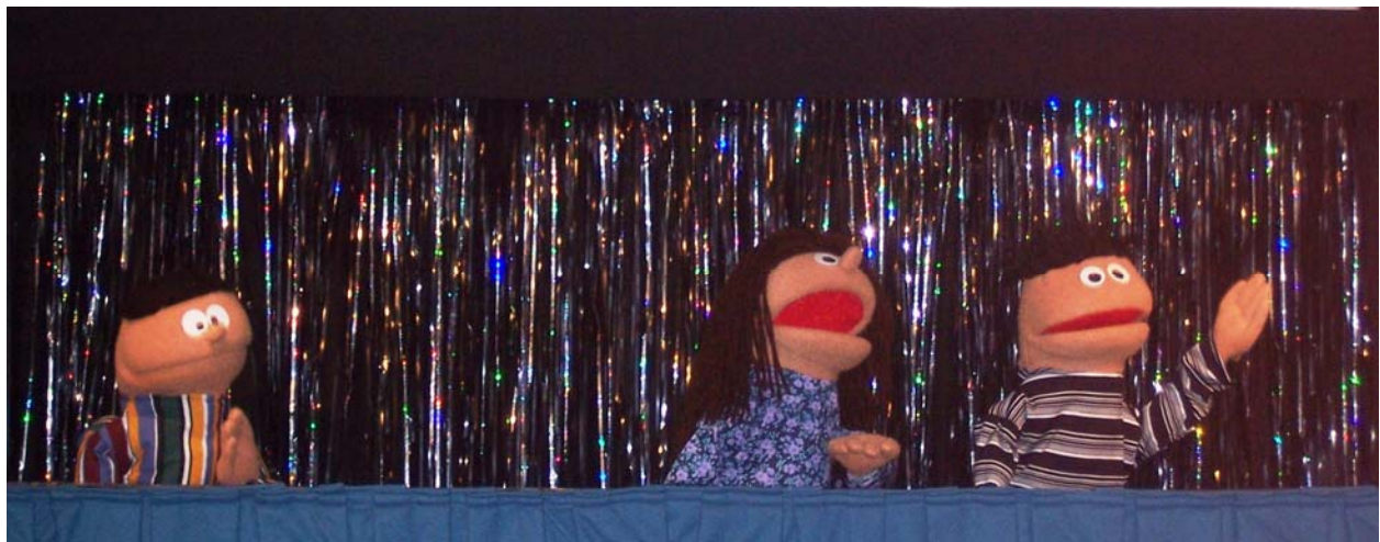
We love to sing along with our puppet friends.